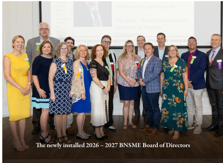
The newly installed 2026 - 2027 BNSME Board of Directors