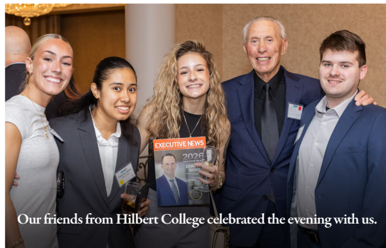
Our friends from Hilbert College celebrated the evening with us.