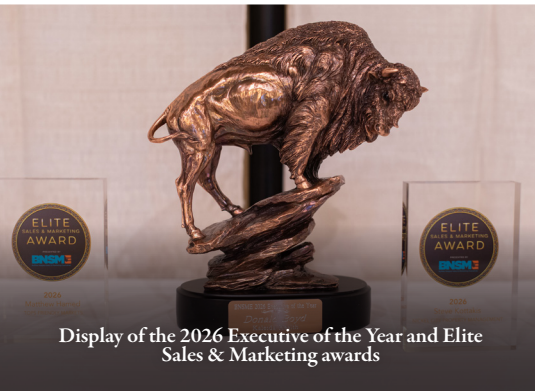
Display of the 2026 Executive of the Year and Elite Sales & Marketing awards