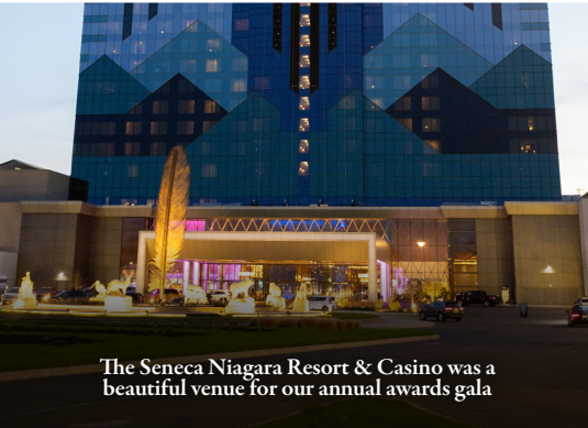
The Seneca Niagara Resort & Casino was a beautiful venue for our annual awards gala

ON APRIL 28, 2025 AT SENECA NIAGARA RESORT & CASINO