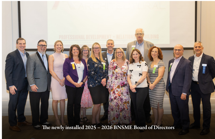
The newly installed 2025 - 2026 BNSME Board of Directors