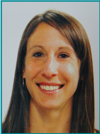
Beth Neel Rigidized Metals