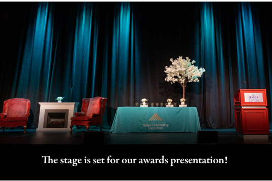
The stage is set for our awards presentation!