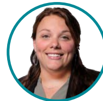
Sara Evans MidCity Office Furniture