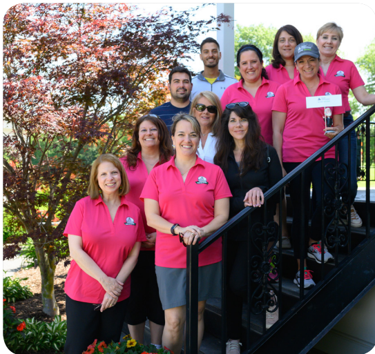
Our volunteers are the best! We could not do it without them all!