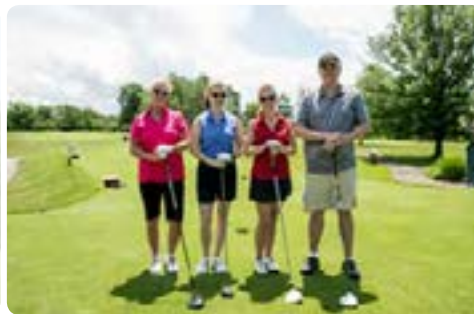
Thank you to the team from Delta Air Lines for their Cart sponsorship!