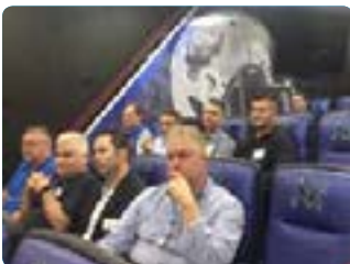
BNSME members and guests were treated to a unique presentation by the UB coaches inside the team meeting room at UB Stadium.