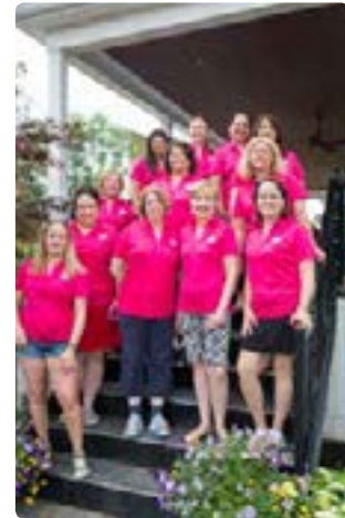
Thank you to our volunteers

Mark your calendars for our 23rd golf outing on Monday, June 18, 2018!