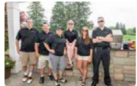
A delicious lunch was provided by the Longhorn Steakhouse team.